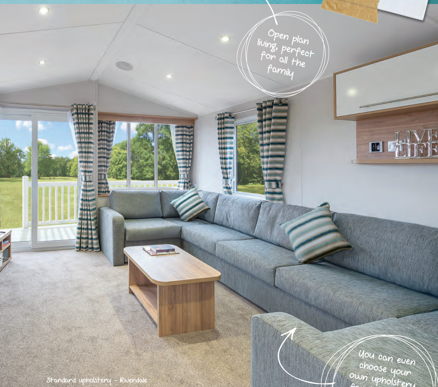
Standard upholstery - Rivendale

Open plan living, perfect for all the family